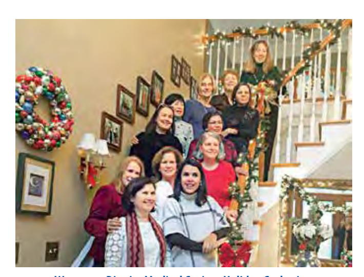
Worcester District Medical Society Holiday Gathering