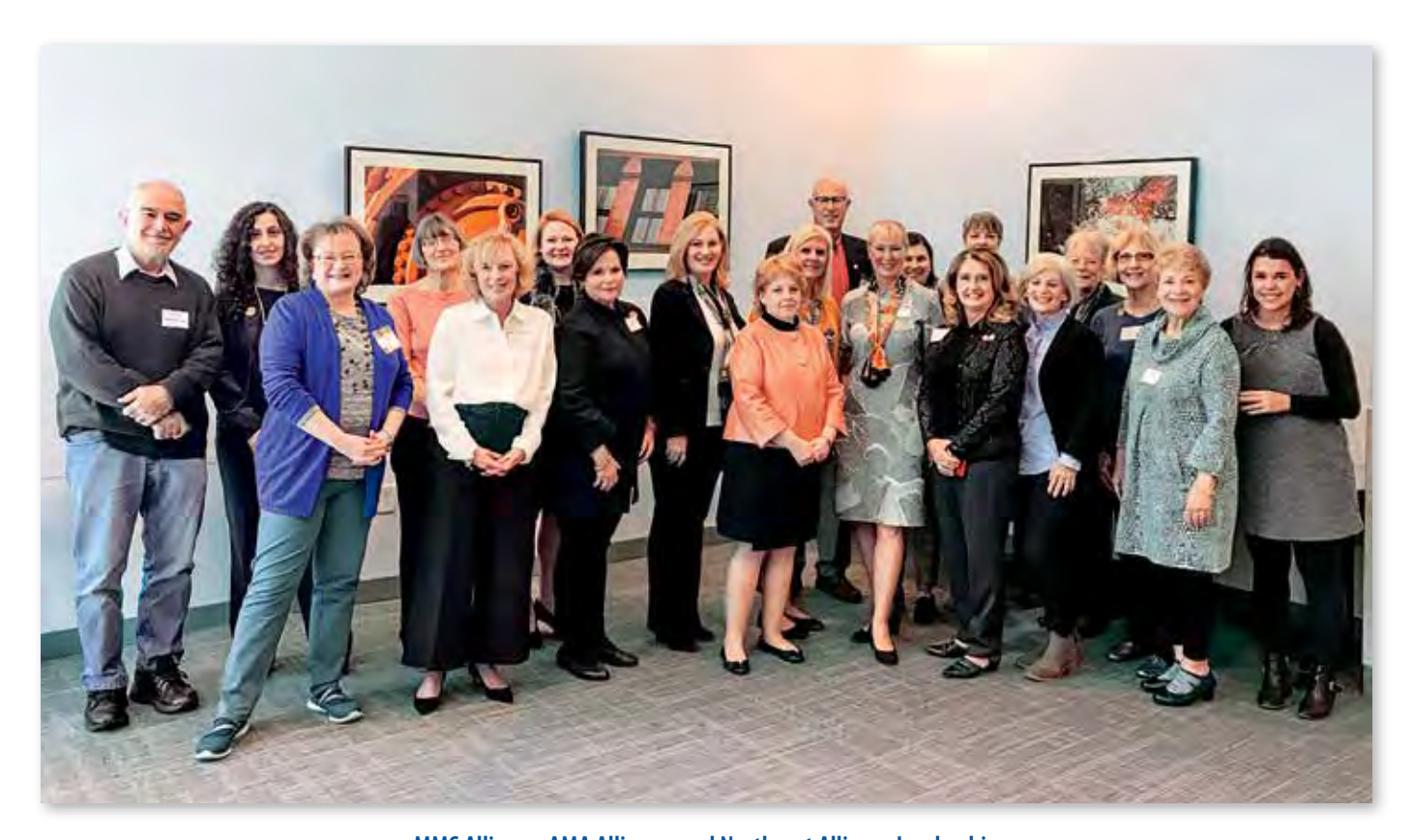
MMS Alliance, AMA Alliance, and Northeast Alliance Leadership