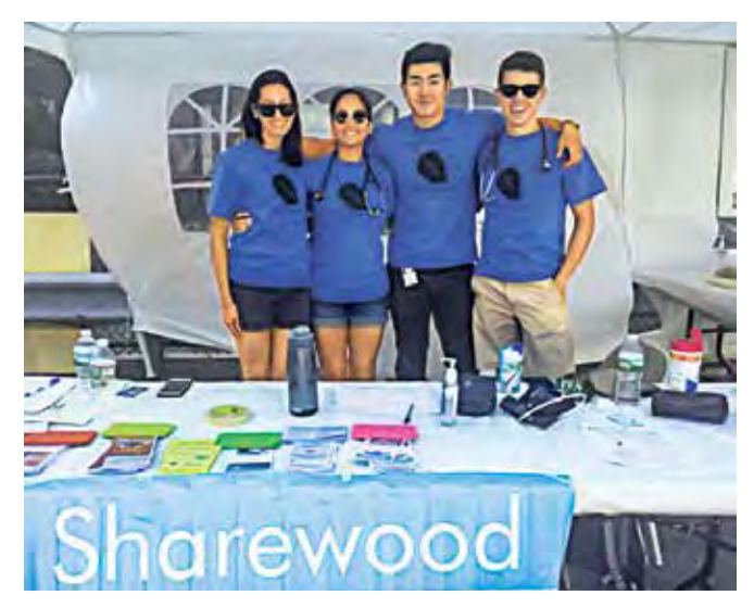
Sharewood Project, Malden

The Foundation is a supporting organization of the Massachusetts Medical Society, the statewide association of physicians, and the MMS Alliance, the organization of physicians' spouses, physicians, medical students, partners, and friends committed to advancing the health and well-being of the family of medicine. The Foundation's mission is to support the charitable and educational activities of the Society and Alliance and address issues affecting the health, benefit, and welfare of the community.