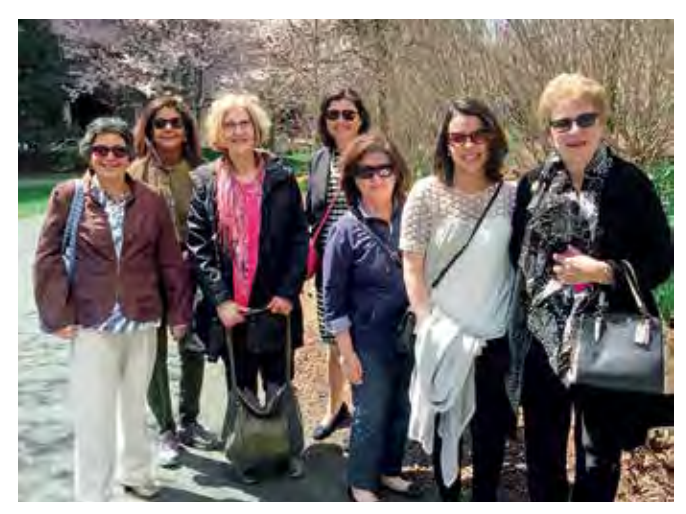
Worcester District Alliance Members