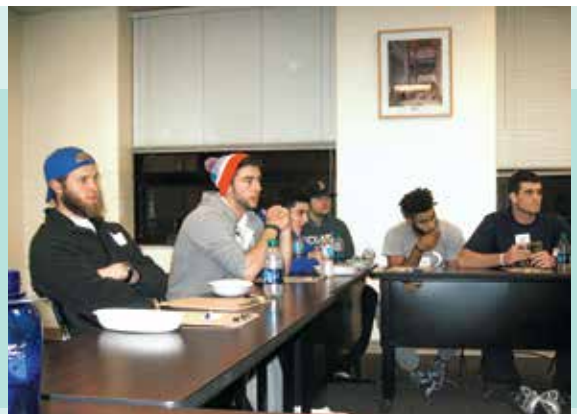
Katie Brown Educational Program holds a focus group with Assumption College baseball players to address relationship violence, dating violence, and sexual assault within the college community.