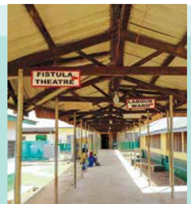
Tamale Fistula Center in Northern Ghana: While the repairs and hospital stay are free of charge for the patients, transportation costs prevent some patients for coming in.