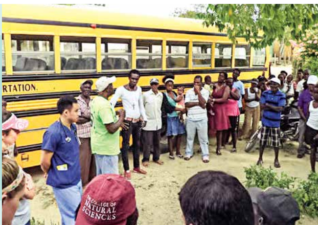
Community Meeting in Batey 18 to communicate practical ways to improve health and sanitation.