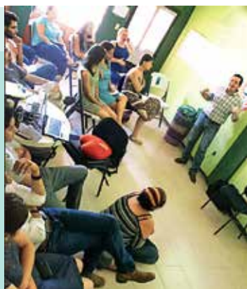
The monthly course for pasantes at CES. CES works in ten rural communities in Chiapas, supporting 10 pasantes with clinical supervision, monthly classes, global health training, and supplementing the meager income, medications, and supplies that the government offers.