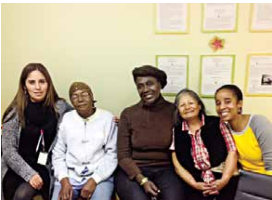
Women of Means community health workers with three women enrolled in the MHWW program at a support group meeting.

Rosie's Place, Boston — $5,000 to support the Community Health Outreach Worker Program, which provides medical and health support for poor women unable to access adequate medical care because of developmental delays, chronic mental illness, or substance abuse.