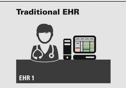
Figure 1. Creating an Ecosystem for Apps

The lower panel shows a classic EHR with a standard view of the data. Above is shown an ecosystem of apps supported by a uniform public application programming interface (API) for healthcare data. A third party app written once can run anywhere. The app can be reused on multiple EHRs and other forms of health information technology. The end user can select apps from a gallery or "app store" and, just as on a smart phone, one app can be readily substituted for another.