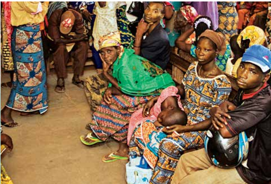
Patients wait on clinic day — Baptist Medical Center, Nalerigu, Northern Ghana