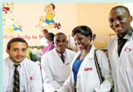
Mbarara University of Science and Technology students on the pediatric ward.

“The potential impact of establishing a training program for POCUS is significant, but not surprising. What I did not expect, though, was how a simple effort to improve one aspect of the training program — the reporting of ultrasound results — would influence patient care at a systems level.”